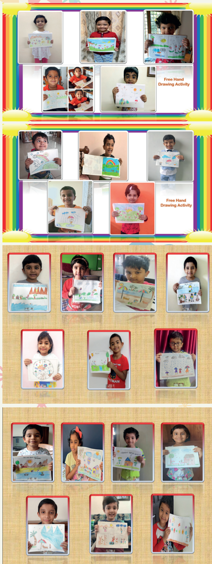
GT FREE HAND DRAWING